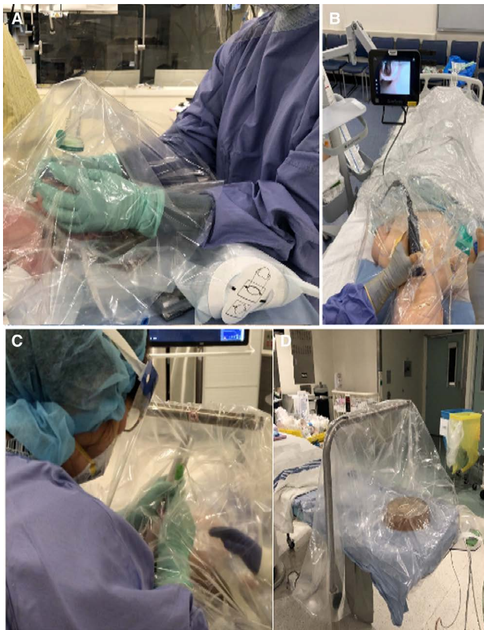
Figure 2. A depiction of transparent drapes being used as an aerosolization barrier during mask induction in a patient (A); video laryngoscopy intubation in a manikin (B); direct laryngoscopy in a real patient (C); and 3-drape technique using an anesthesia elbow and suction under the transparent drapes (D).

desirable approaches were high- or low-flow nasal cannula or bag-mask ventilation, though these techniques may be unavoidable at times. A simple oxygen mask placed on top of a nasal cannula may reduce the risk of aerosol dispersion (Supplemental Digital Content 3, Video 2, http://links.lww.com/AA/D86 ). PeDI-C recommended avoiding techniques that bring the clinician's face or stethoscope near the patient to verify leak pressures for endotracheal tube (ETT) and supraglottic airway (SGA). Clinicians can use the ventilator's measurements of expired and inspired tidal volume and handheld manometers to titrate cuff inflation. Wireless stethoscopes and point-of-care ultrasound can be used to confirm bilateral ventilation of the lungs. A "high-quality" viral filter should be placed between the breathing circuit and