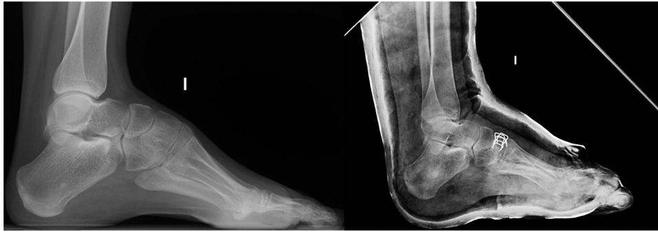
Fig. 5 Severe cavovarus deformity treated by Tarsal osteotomy.

which is normally located at cuneiforms level. Besides, an osteotomy in a growing child should be performed at diaphyseal level, due to the risk of growth plate injury, which moves correction even further away from the apex. Correcting the deformity at the cuneiforms has the inherent mechanical advantage of achieving correction at the apex of the deformity, despite the fact that some studies have suggested a lesser effect over the hindfoot correction. 42