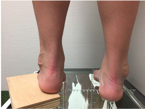
Fig. 1 Coleman test: block placed under the lateral border of the foot and heel, while the medial side of the floor is lying on the floor. Observe the correction of the heel varus.