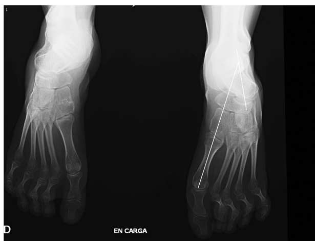
Fig. 4 Standing AP film, in a severe pes cavovarus. Note the abnormal relationship of the talus and 1MTT.

Notes. AP, anteroposterior; 1MTT, first metatarsal.