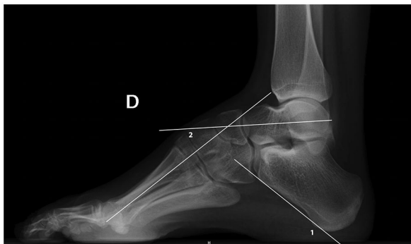
Fig. 3 Lateral standing film of a cavovarus foot. (1) indicating the calcaneal pitch angle, (2) indicating the abnormal Meary angle.