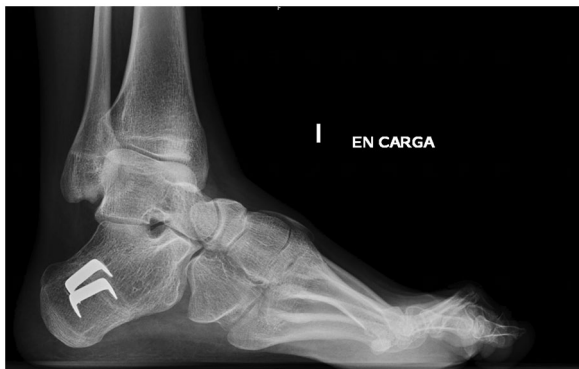
Fig. 2 Standing lateral film of the foot. Note the posterior location of the lateral malleolus and the distorted image of the talar dome, indicating external rotation deformity at the level of the ankle.

The examination should also include: a detailed spine examination looking for hairy patches, dimples or structural deformities. Hip assessment including motion and a Trendelenburg test to rule out hip dysplasia. Finally, the hands should be evaluated for wasting of the intrinsic muscles.