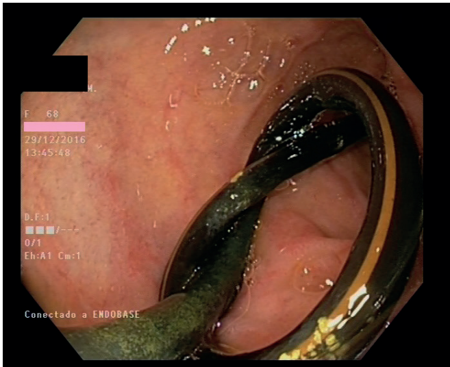
Fig. 2. Duodenal probe tying.